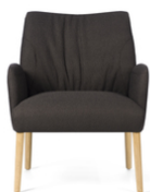
ENORA H40 PB +A