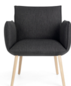
SOFT UNI H40 +A