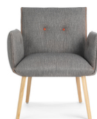
SODA H40 +A