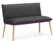
SOFT DUO BI H47 -A